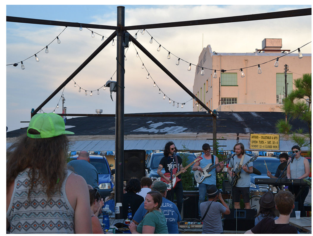
Oklahoma Cloud Factory at OKC Farmers Market

"I've done some fundraiser events for the YWCA and stuff like that.