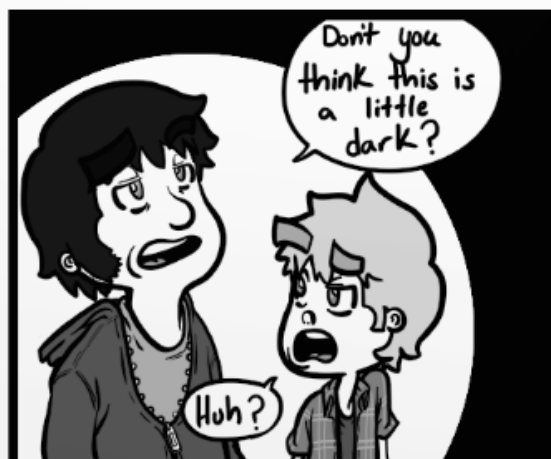
Trained Thinking 039

with chemotherapy, according to the Mayo Clinic.