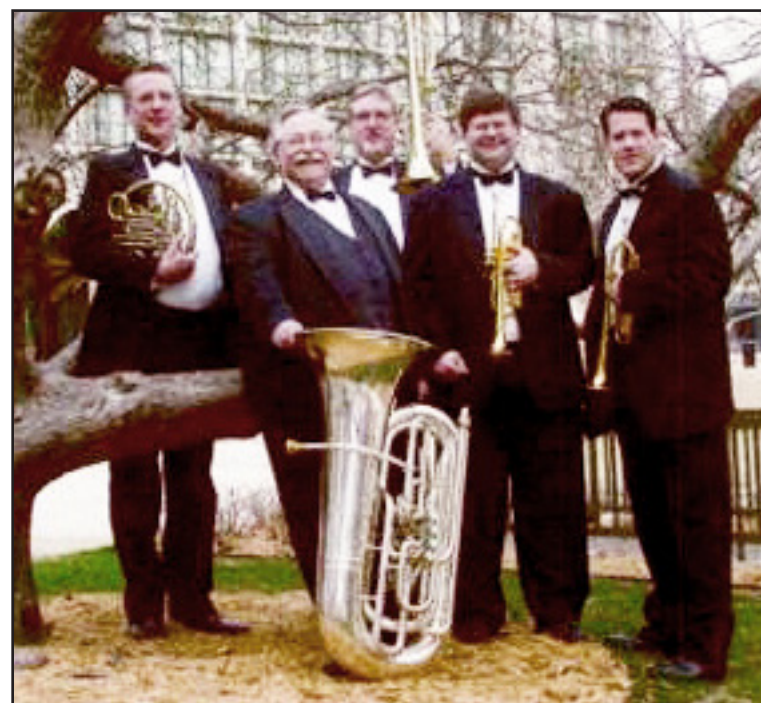
The Bravo Brass Quintet will perform music including classical, jazz, some popular songs and traditional tunes Tuesday, Nov. 12 in the Bruce Owen Theater.

for seniors $17, and for general admission $20. For more information about the Bravo Brass