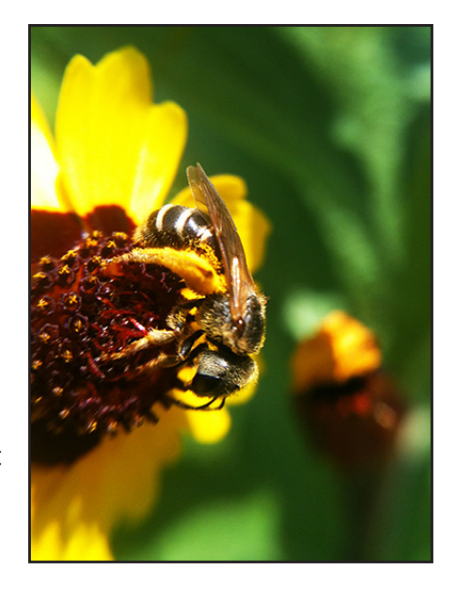
RIGHT: "The Great Pollinator" by Beau Baker using an iPhone 3GS.