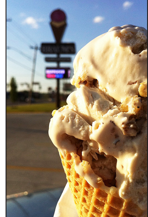
TOP: "Black Walnut" by Brenda Breeding with an iPhone 3 and Photoshopped.

LEFT: "Intricate," by Ashlie Mowdy with an iPhone 4 using Hipstamatic.