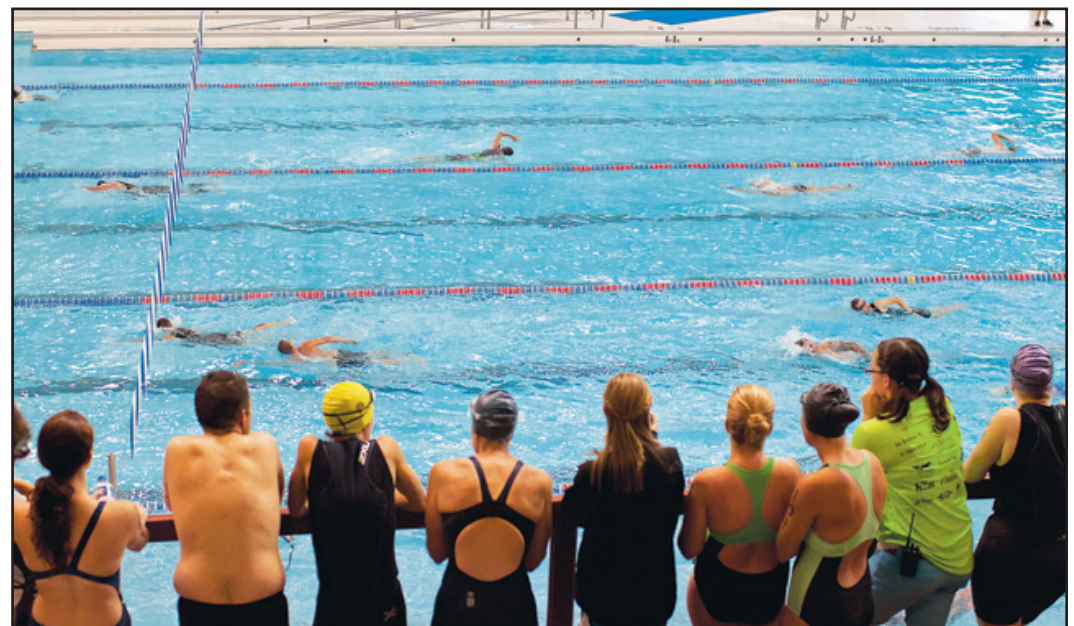
Swimmers race through the first part of the SuperSprint Triathlon, on campus June 8. Over 200 participants from Oklahoma, Texas, Indiana and Tennessee competed in the triathlon.