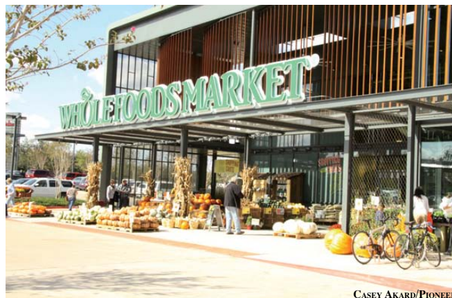
Whole Foods Supermarket located at 6001 N. Western brings consumers smart healthy choices at a reasonable price. These options include organic produce, gourmet food options, fresh seafood and meats and locally made cheeses.

On the east side of the store is a bakery, sandwich