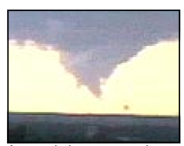
A tornado hovers near the city of El Reno on June 13.

Security officers will use a portable bull horn for the